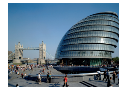
Greater London Authority